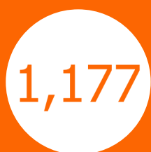
FAMILY ECONOMIC EMPOWERMENT

Through our work for vulnerable primary school children in the School feeding intervention 4,482 children received lunch at school and 6,575 children received breakfast . We have carried out this noble task in close cooperation with the Ministry of Education and provided this in 28 public schools, serving vulnerable children. Through sharp choices and efficient operations, Macheo has been able to provide a healthy lunch for only 26 Kenyan Shilling per day, and breakfast for 4 Kenyan Shilling.