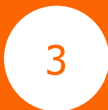
IMPROVE SCHOOL INFRASTRUCTURE