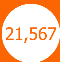
REPRODUCTIVE HEALTH AND LIFE SKILLS TRAINING