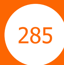
ASSIST TEENAGE MOTHERS