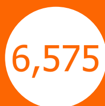
SCHOOL FEEDING: BREAKFAST