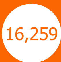
SPORTS & GAMES IN SCHOOLS