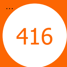
IMPROVE PHYSICAL LIVING CONDITIONS